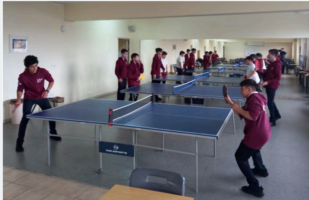
Table Tennis Tournament Ping Pong Club

After-school clubs help boost students' self-esteem and self-confidence by keeping students active and healthy